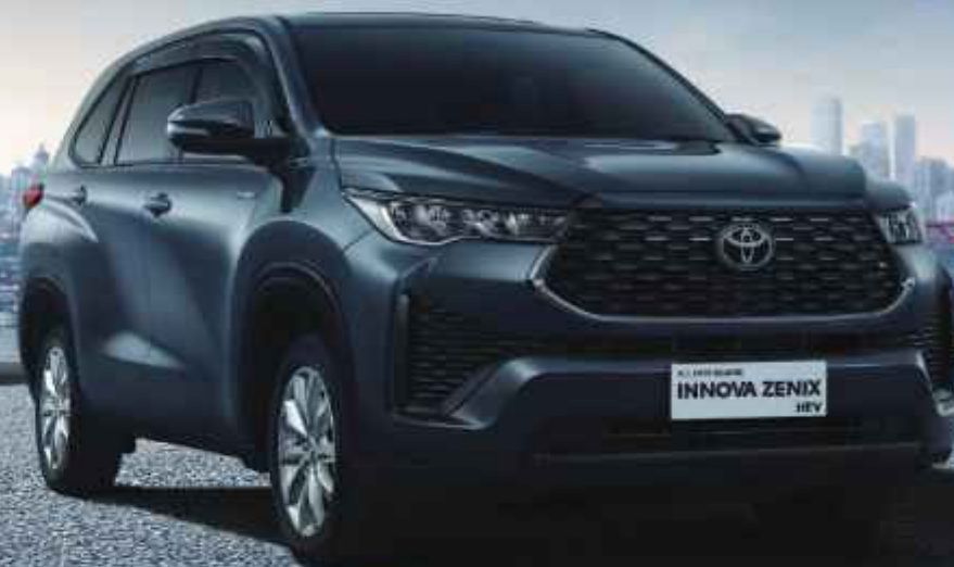
V HEV Type