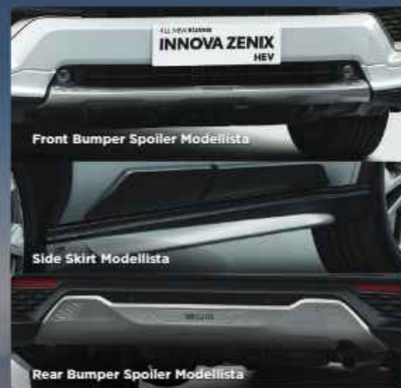
MODELLISTA PACKAGE (Gasoline Type)

*TCO parts are sold separately, individually or in packages. The parts availability may differ depending on the dealer. Contact your nearest dealer to learn more.