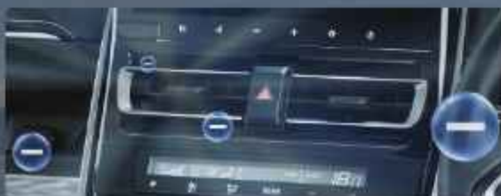
AIR PURIFIER (G Type)