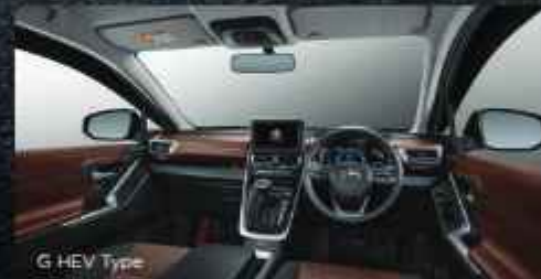
G HEV Type

Altering an advanced system, it creates flawless combustion, achieves dynamic performance, and more efficient fuel consumption for a fascinating journey.