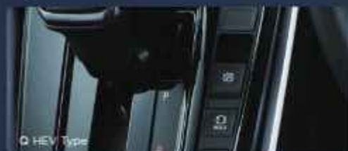
Q HEV Type

Embedded with convenience lamp covered on the black premium leather material will bring a pleasant experience in every voyage.