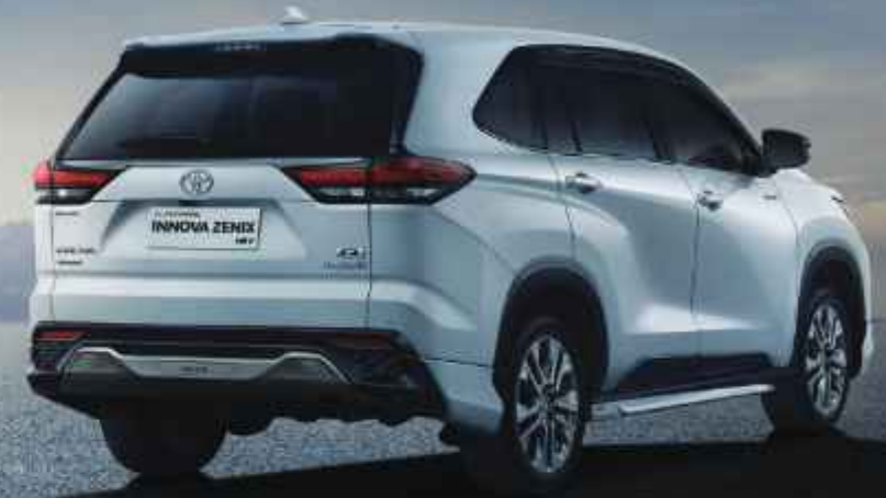
Q HEV Modellista Type*