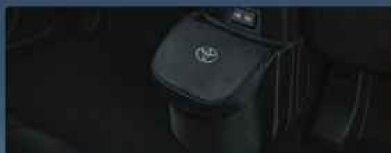
MULTIFUNCTION BOX (All Type)