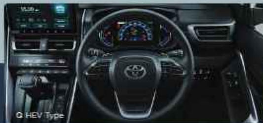
Q HEV Type

Control all entertainment through Bluetooth, Wi-Fi, and Voice Recognition or navigate your daily life easier with smartphone connectivity and NFC E-Toll Card Checking (e-Money & Flazz) for your comfortable journey.