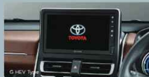
G HEV Type

An engaging visual to keep you enlightened for the essential information on the road.