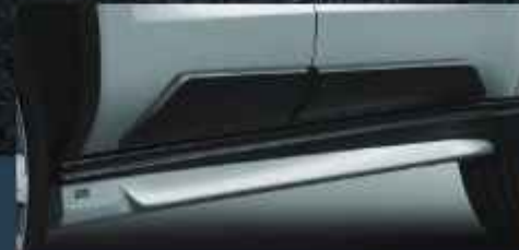
NEW SIDE BODY MOULDING WITH SIDE SKIRT MODELLISTA (Q HEV & V HEV Modellista Type)

Capture the dignified feeling on your journey with Front Bumper Spoiler's look with Modellista artistry.