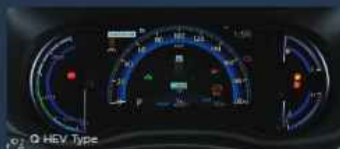
Q HEV Type

Begin your wonderful journey with just a simple touch as the parking brake is now installed with electric functionality.