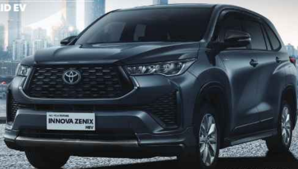
V HEV Modellista Type