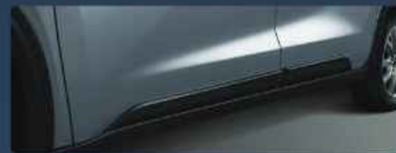
SIDE BODY MOULDING (V Gasoline & G Type)