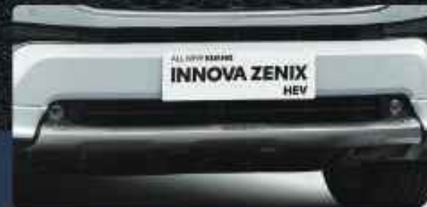
NEW FRONT BUMPER SPOILER MODELLISTA (Q HEV & V HEV Modellista Type)

The vigorous design Front Grille is enhanced by the side & upper Modellista ornament (available as TCO) that applies to create a majestic presence.