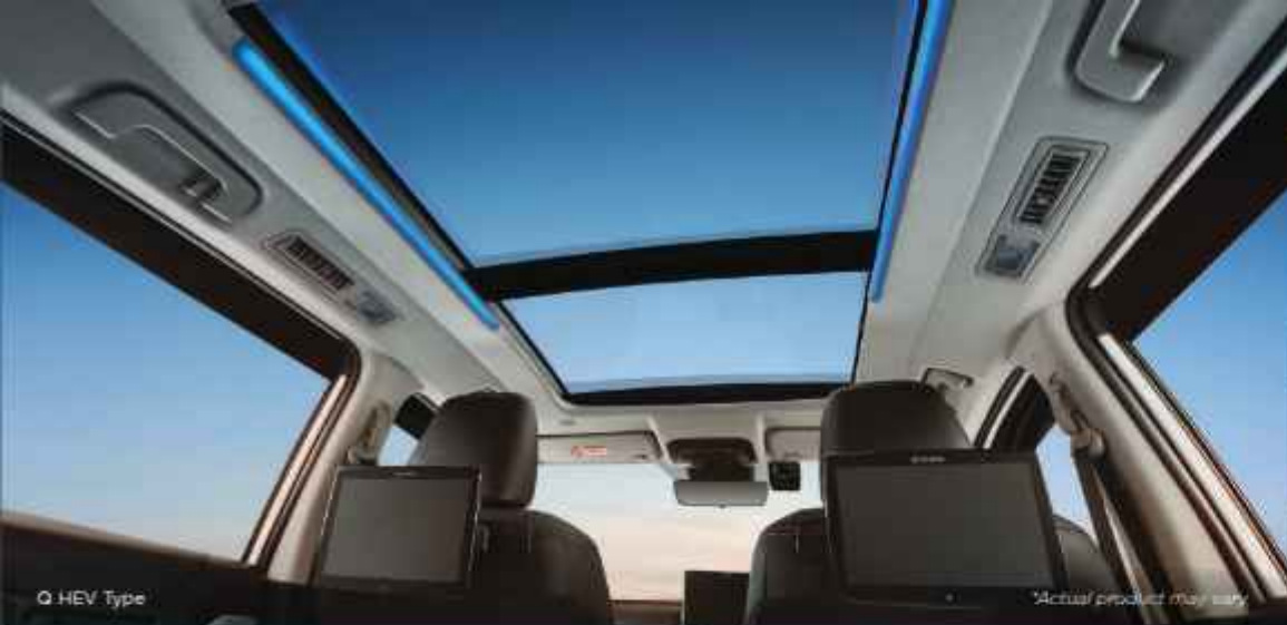
Q HEV Type