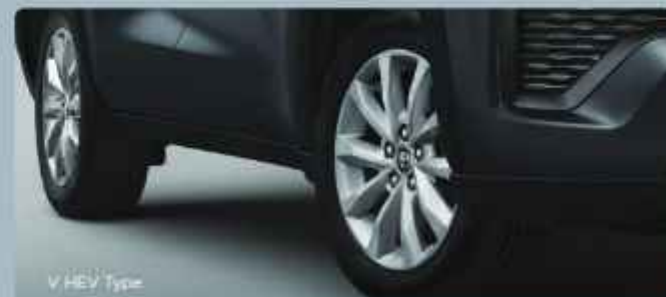
V HEV Type

Choose what you desired by switching to Eco mode for a smooth driving experience, Power mode for maximum engine power, and EV Mode to go with full electric power to reduce fuel consumption.