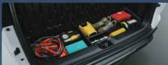
INTEGRATED CAR STORAGE ORGANIZER (All Type)