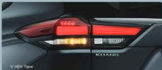
V HEV Type

It's not an average MPV, it's a dynamic vehicle with captivating features of the 7" TFT MID, Panoramic Roof, 10" Head Unit, 10" Dual RSE, and Electric Parking Brake for you to energize your life with The All-New Kijang Innova Zenix.