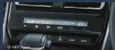
Q HEV Type

An entire digital instrument to provide and convey essential information about your vehicle.