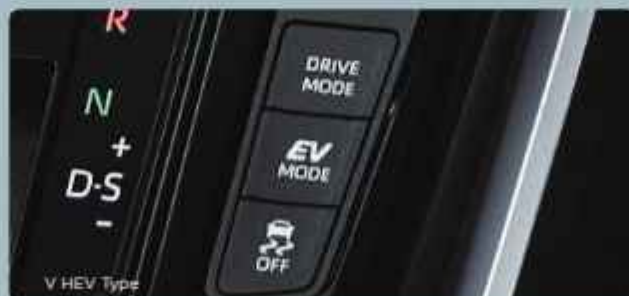
V HEV Type

Enhance the majestic experience on every side as the new rear lamps are designed with modern details to accompany your greatest journey.