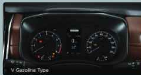
V Gasoline Type

Feel the wonderful journey created by the enhanced Full Dashboard with a two-tone colour design and luxurious Soft Pad.