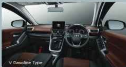
V Gasoline Type

Boost your crossing journey with the captivating silver-painted 16" Alloy Wheel.