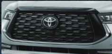
NEW GRILLE ORNAMENT MODELLISTA (Q HEV & V HEV Modellista Type)

The vigorous design Front Grille is enhanced by the side & upper Modellista ornament (available as TCO) that applies to create a majestic presence.