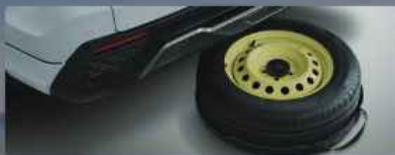
SPARE TIRE COVER (All Type)