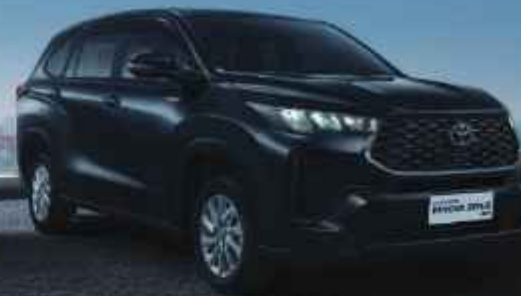
G HEV Type