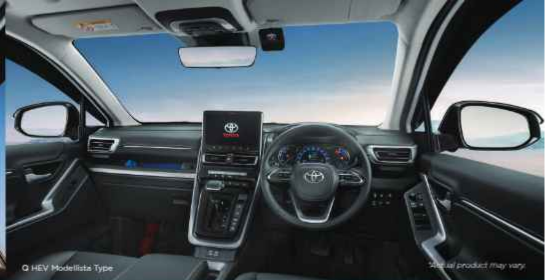
Q HEV Modellista Type