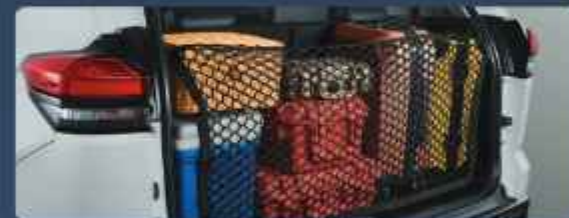
CARGO NET (All Type)