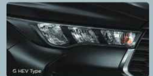
G HEV Type

The enormous entertainment bundle is injected with the Smartphone Connectivity function and NFC for checking e-Toll card (e-Money & Flazz) to deliver your convenience in every journey.