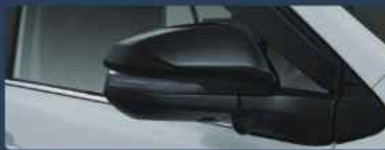
OUTER MIRROR ORNAMENT (All Type)