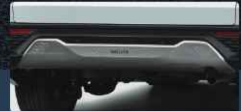
NEW REAR BUMPER SPOILER MODELLISTA (Q HEV & V HEV Modellista Type)

Brings a remarkable elegant look to the side body and prevents the refinement from having any damage when the doors are opened.