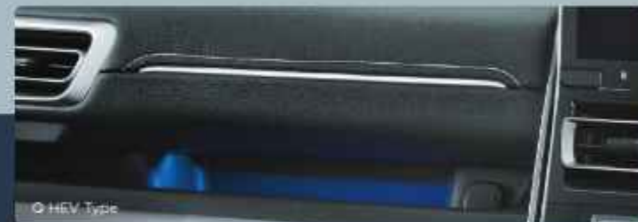
Q HEV Type

Lighter Steering Wheel with better stability and power to control every road you thrive with ease as the Paddle Shift is injected.