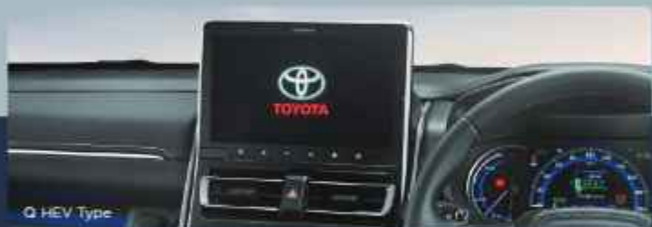
Q HEV Type

The sophisticated journey is guaranteed by the dynamic yet modern design interior as the premium made Soft Pad (All Q HEV & All V Type) and Black Leather Seats give a sense of luxury and spaciousness.