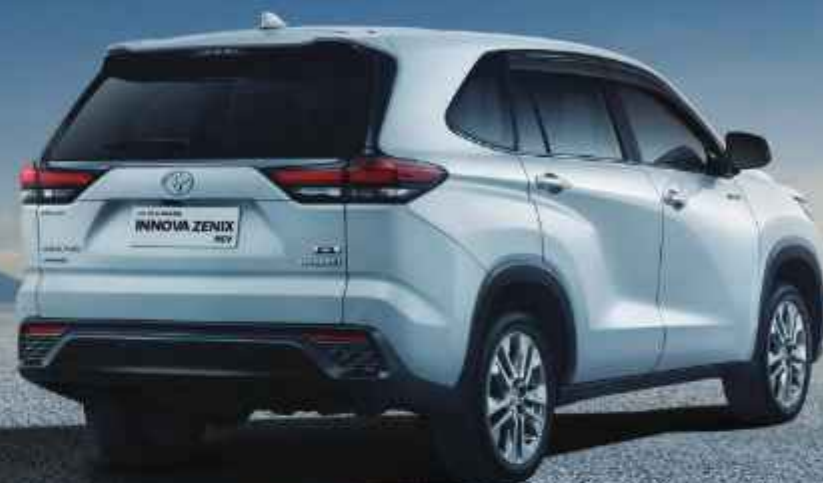
Q HEV Type