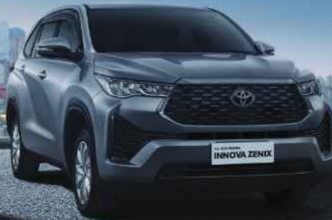
V Gasoline Type