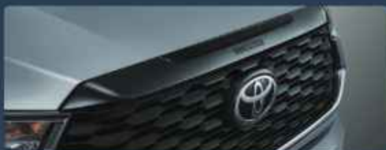
UPPER GRILLE ORNAMENT MODELLISTA (All Type)

Toyota exclusive parts as an option for people to custom their car.