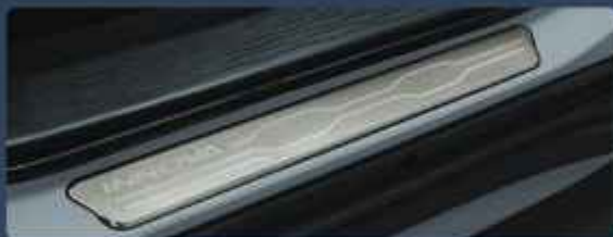
SCUFF PLATE (All Type)