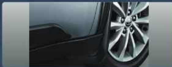
MUDGUARD (V Gasoline & G Type)