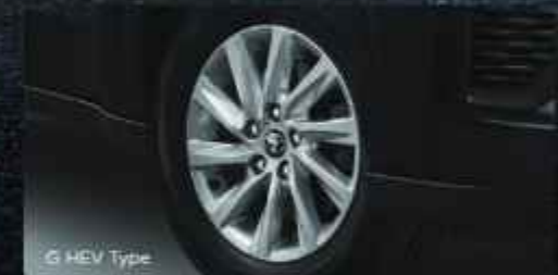
G HEV Type