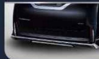
Rear Skirt Modellista''

*Available for Toyota All New Alphard All Type.