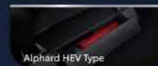
Alphard HEV Type

Indulge you in every journey with entertainment through bigger head unit. (All Type)