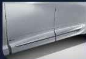
Side Skirt Modellista'