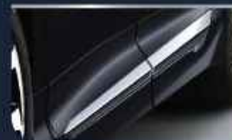
Side Skirt Modellista''