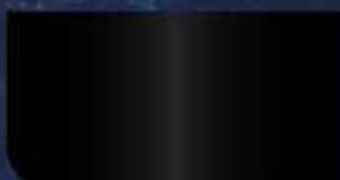
Black (Available for All New Alphard)