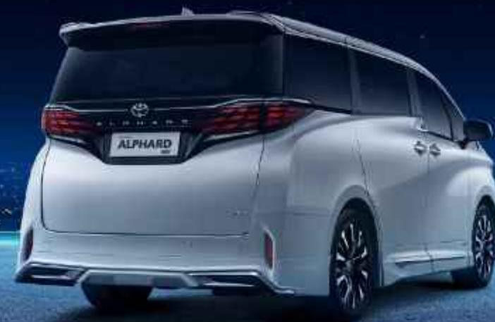
2.5 HEV Type*