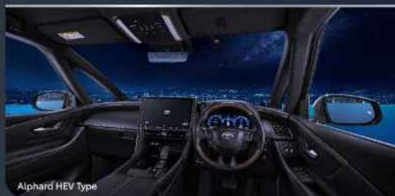
Alphard HEV Type