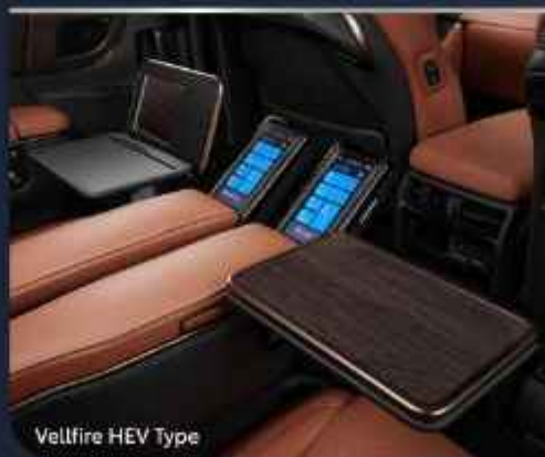
Vellfire HEV Type

Create a sense of ambience through the classy Interior Design, including the Steering Wheel, 12.3" TFT MID, 14" Head Unit Display, and Wireless Charger.