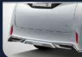
Rear Skirt Modellista'