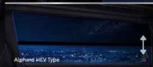
Alphard HEV Type

Experience convenience throughout every journey on Captain Seat (All Type) supported Detachable Smartphone-like Remote Control (All HEV Type) for private ambience and adjustable Rear Side Shade. (All Type)