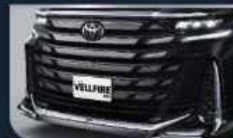
Front Skirt Modellista''