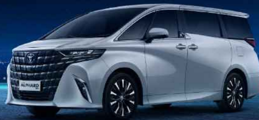
2.5 HEV Type

Experience sophisticated feeling in every path with Toyota All New Alphard HEV and bring sustainable impact for environment.