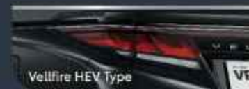
Vellfire HEV Type

The Vellfire emblem detail are designed to strengthen the extravagance look on every journey.