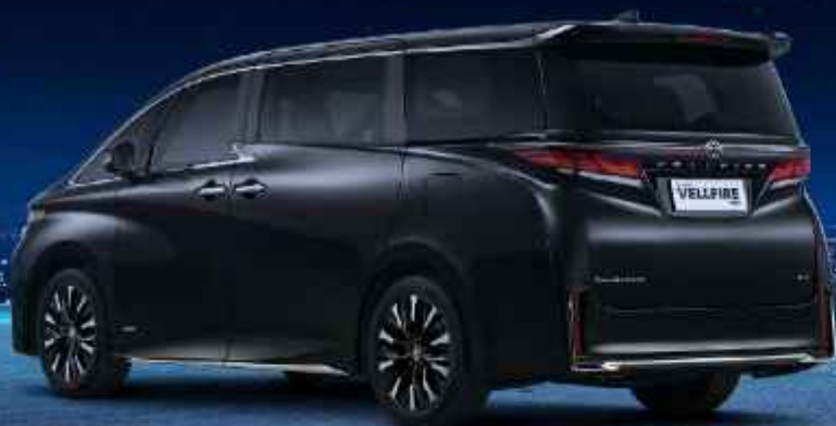
Vellfire 2.5 HEV Type