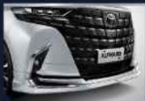
Front Skirt Modellista'

*Image shown are for illustration purpose only.