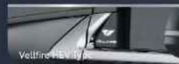
Vellfire HEV Type

Bring out the bold look to the surroundings in all ways.