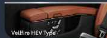
Vellfire HEV Type

Provide a Multifunction Table to support your productivity, complete with Detachable Smartphone-like remote control.